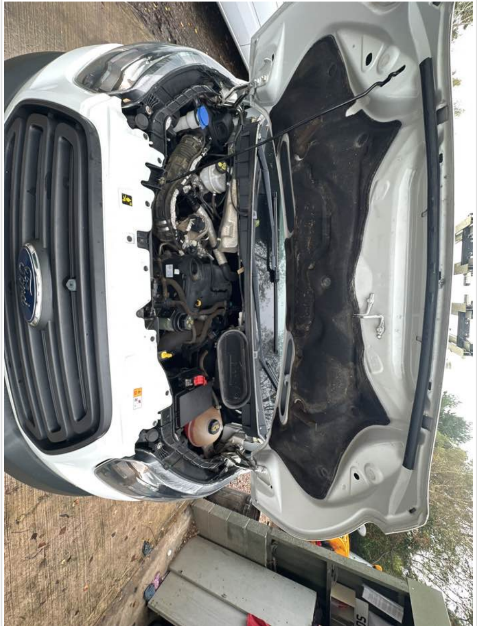
Engine bay photo