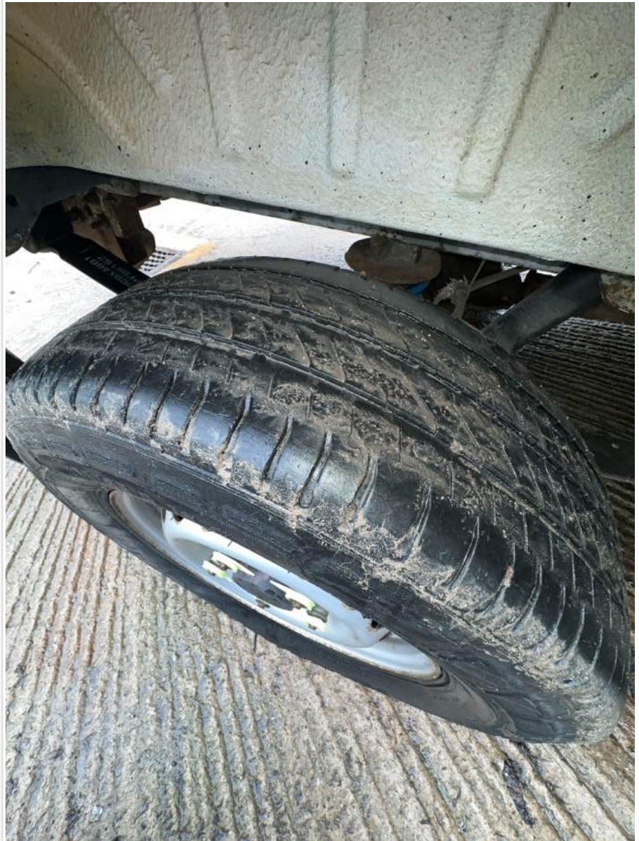
Images of tyre