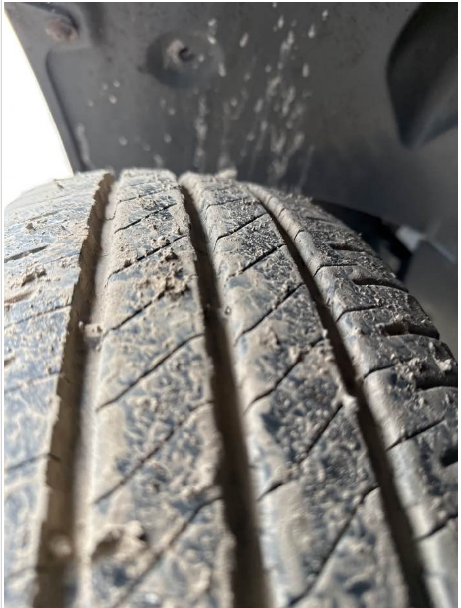
Images of tyre