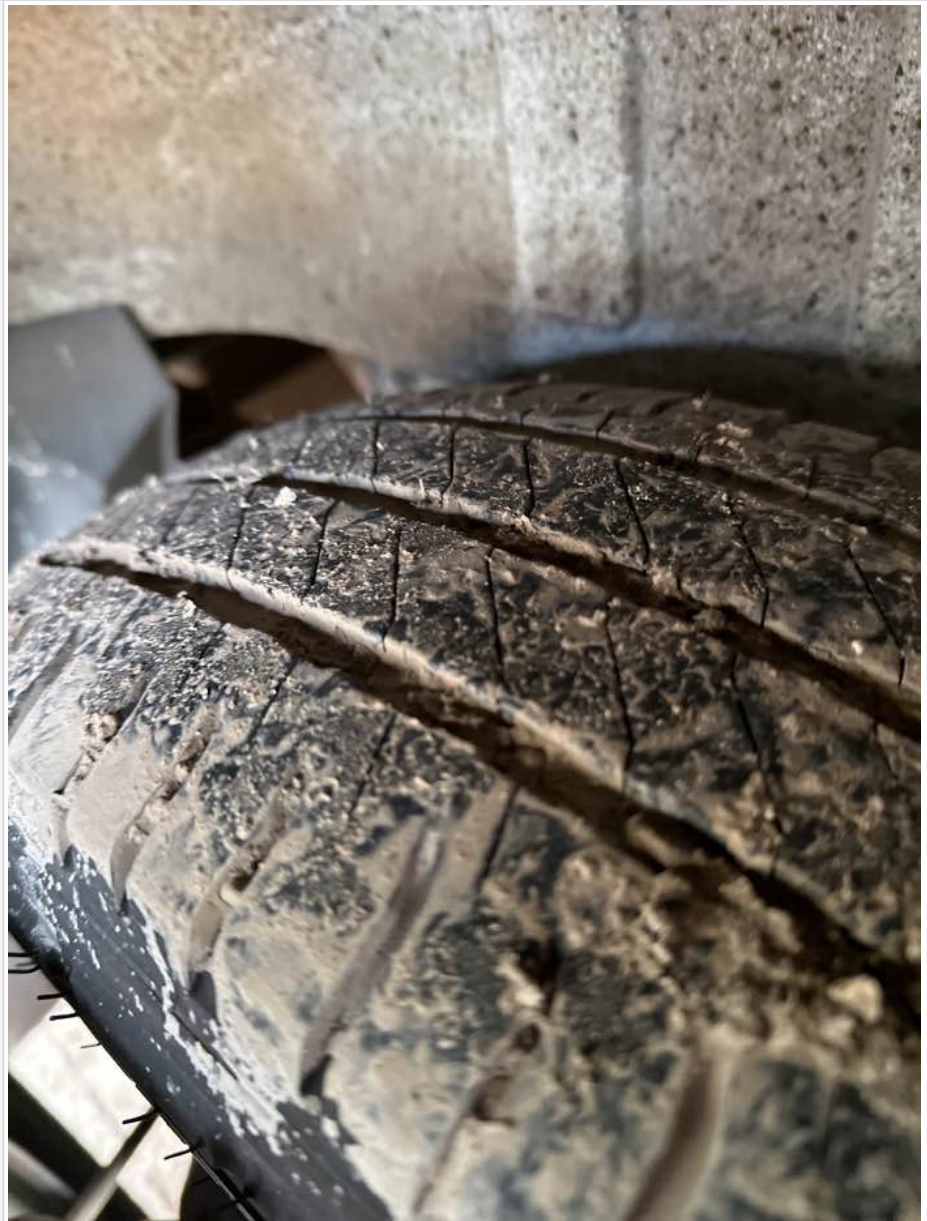
Images of tyre