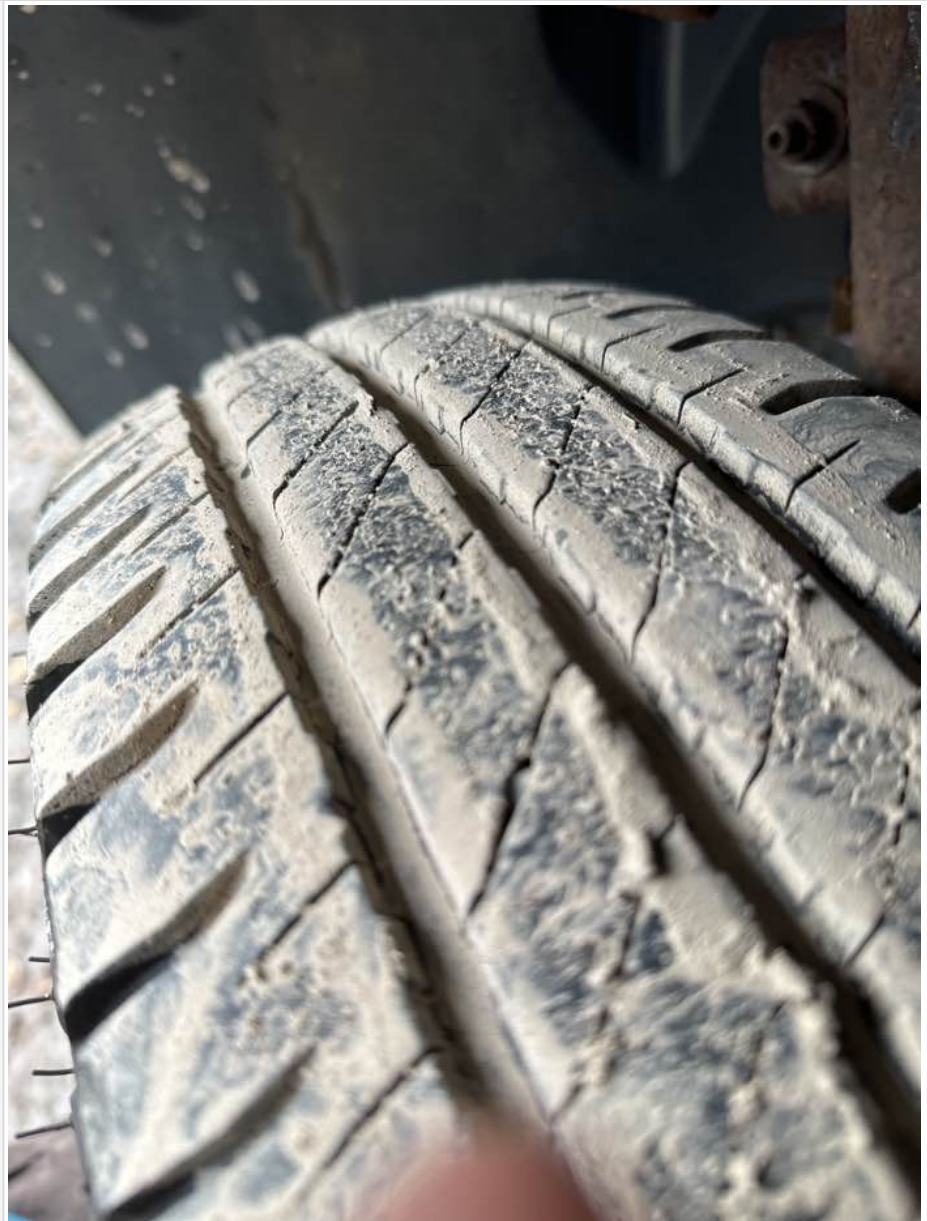
Images of tyre