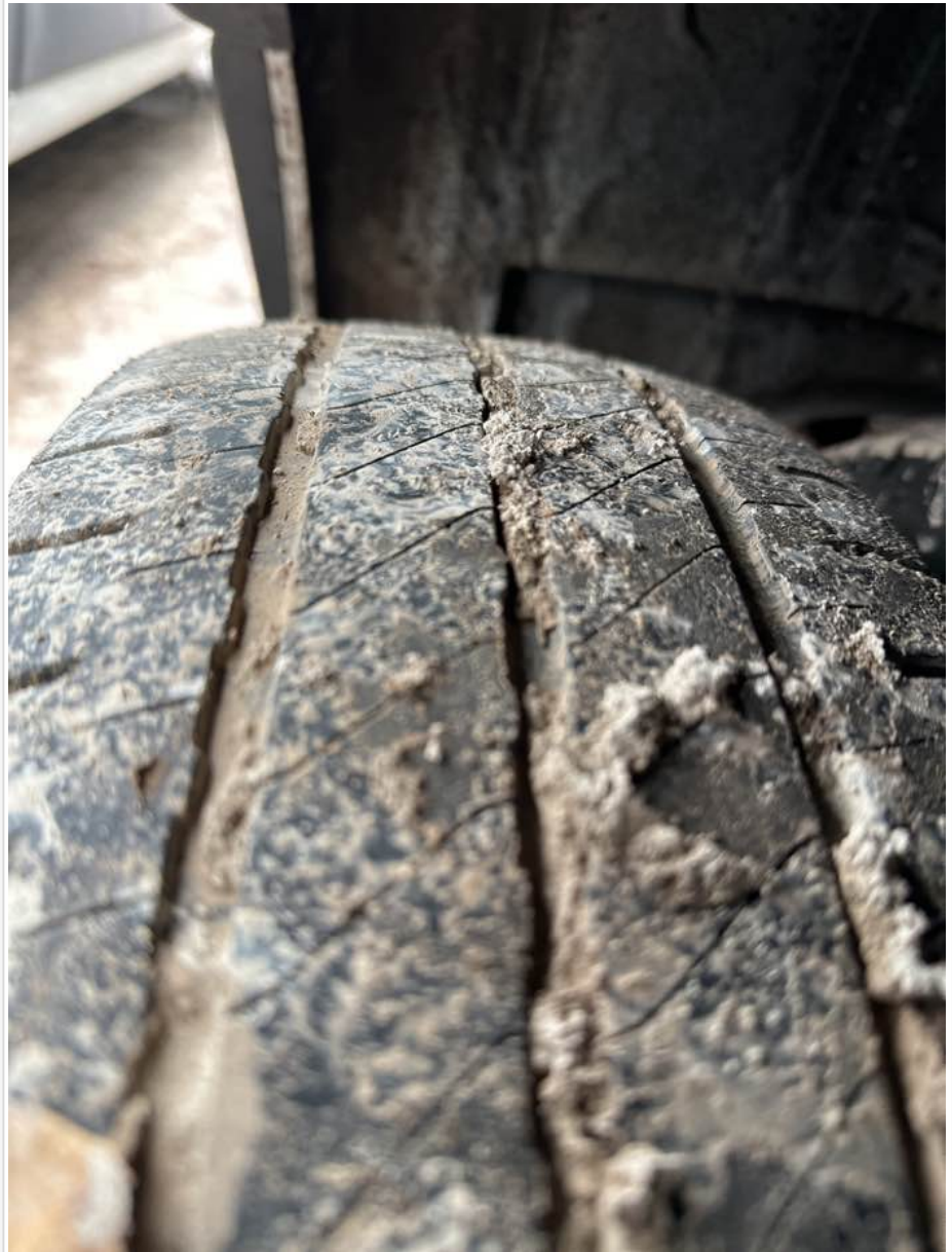
Images of tyre