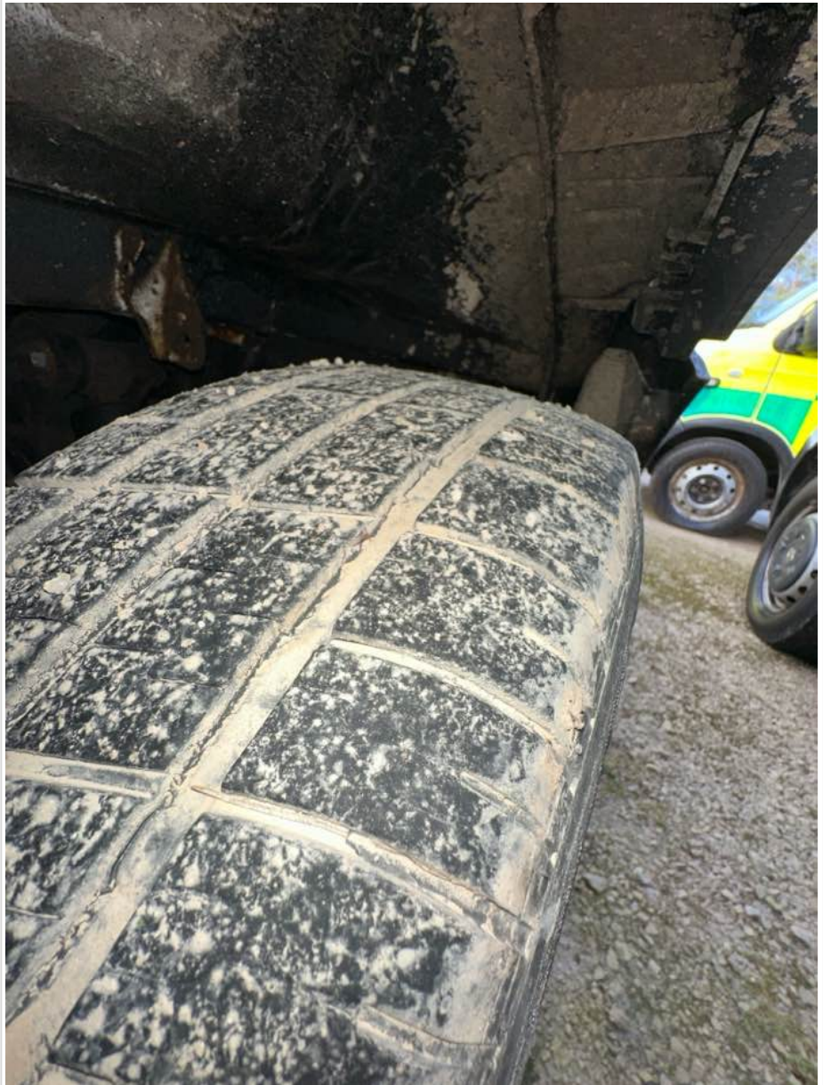
Images of tyre