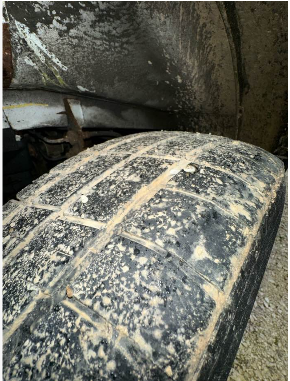
Images of tyre