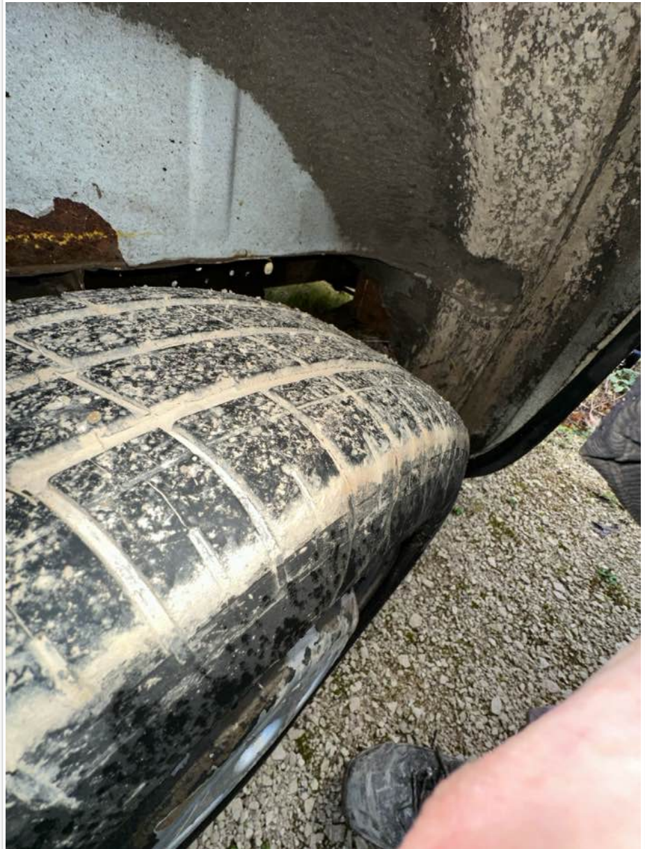
Images of tyre