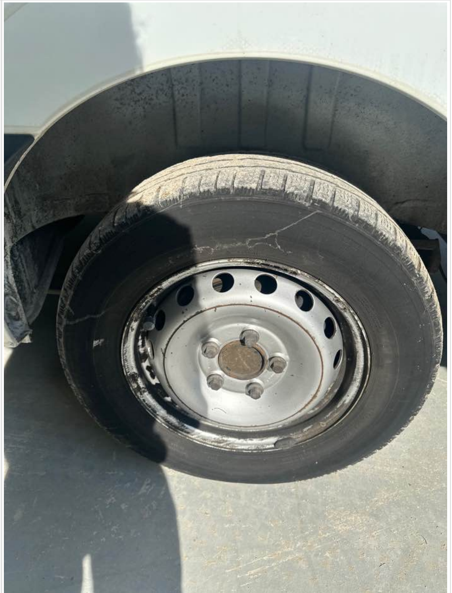
Images of tyre