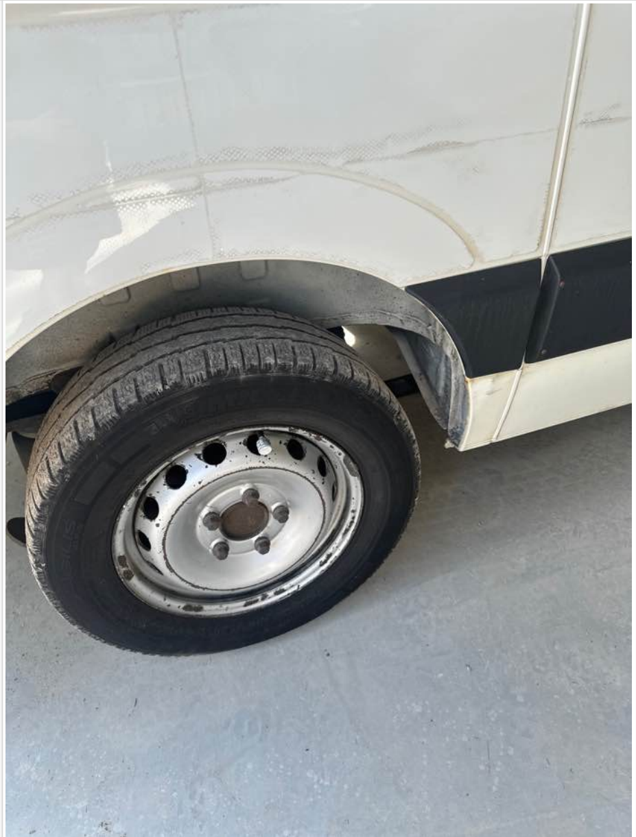
Images of tyre