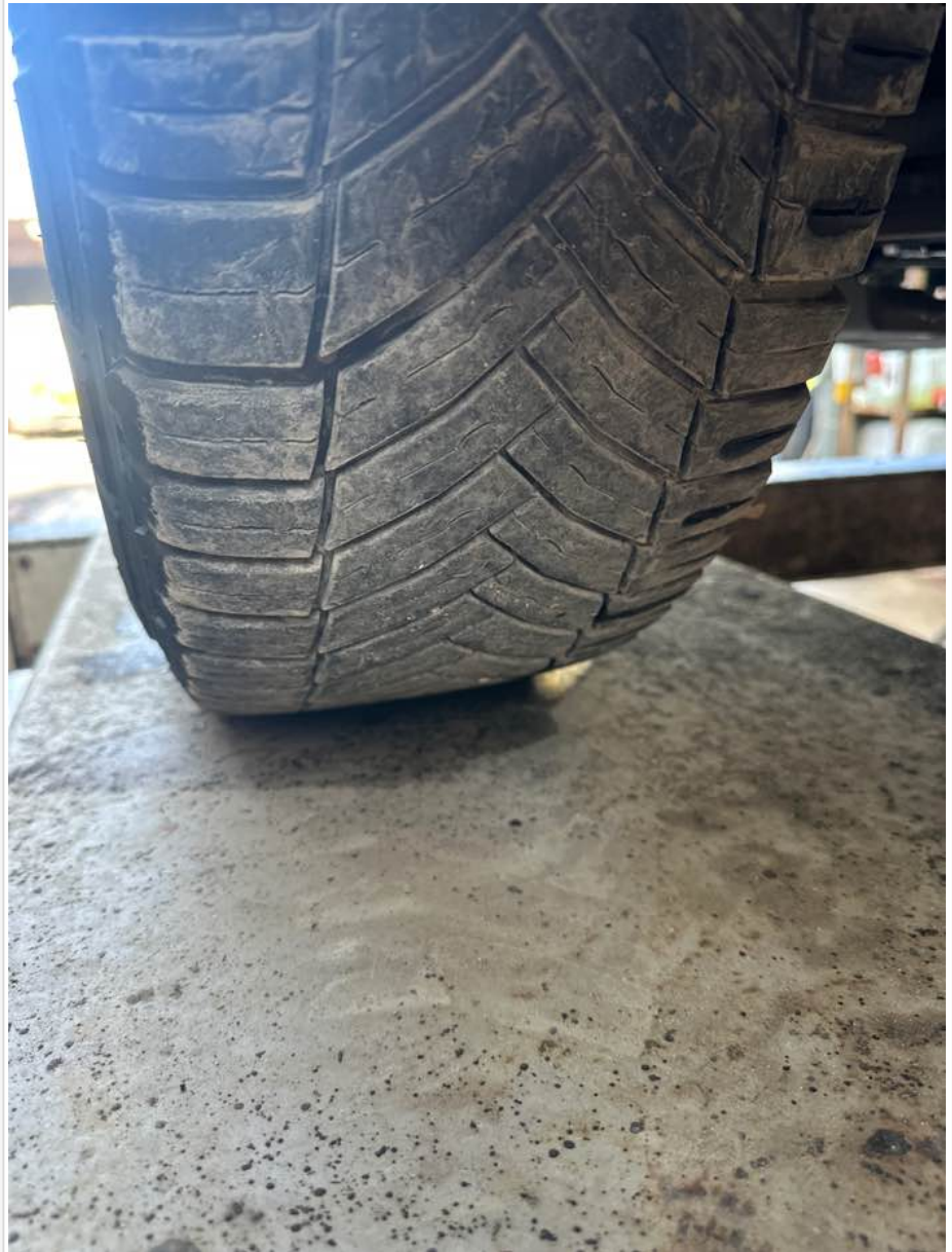
Images of tyre