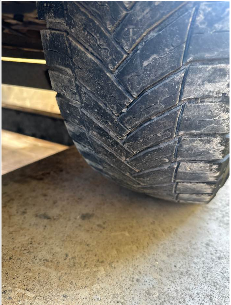
Images of tyre